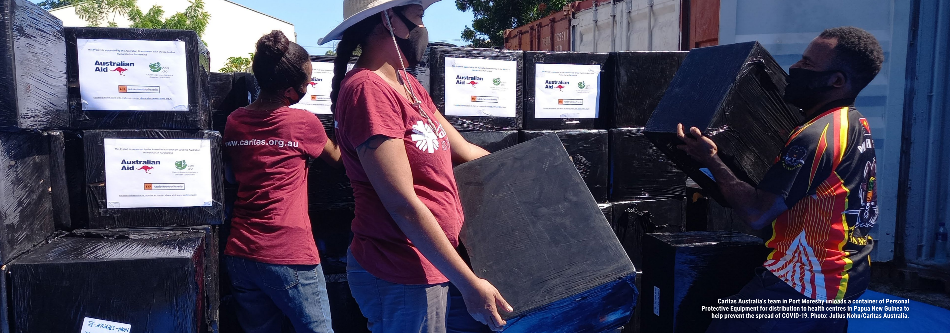
Caritas Australia's team in Port Moresby unloads a container of Personal Protective Equipment for distribution to health centres in Papua New Guinea to help prevent the spread of COVID-19.