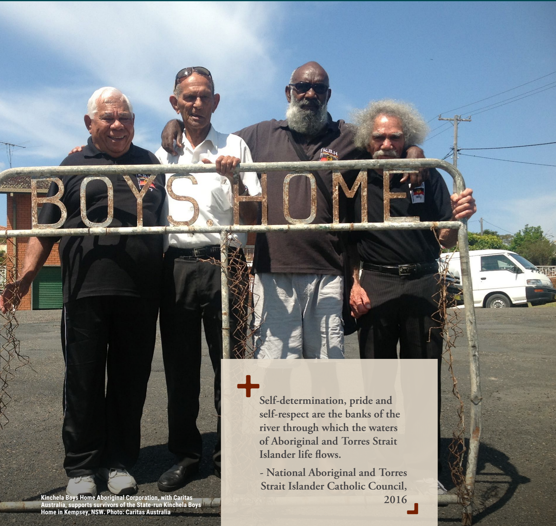
Kinchela Boys Home Aboriginal Corporation, with Caritas Australia, supports survivors of the State-run Kinchela Boys Home in Kempsey, NSW.