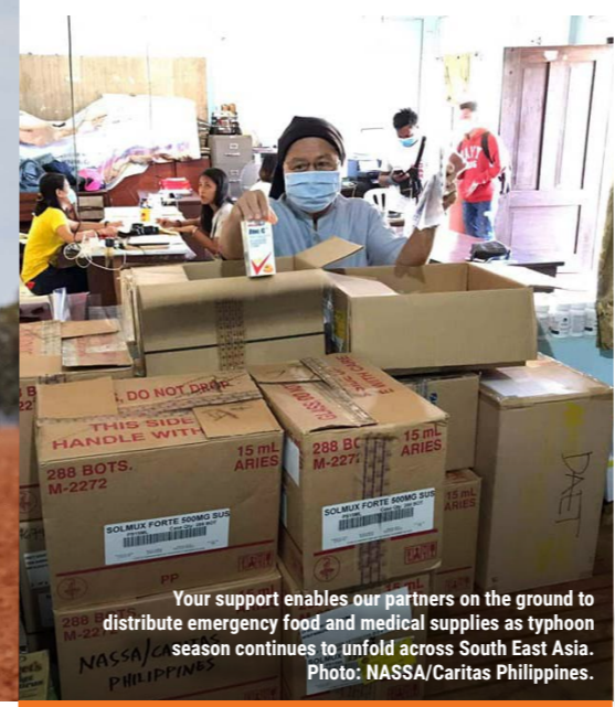
Your support enables our partners on the ground to distribute emergency food and medical supplies as typhoon season continues to unfold across South East Asia.

In the Philippines, a country prone to intense weather events, typhoon season is devastating entire communities. Super Typhoon Goni, the most powerful storm of 2020, whipped across the eastern Philippines with tremendous force, destroying or damaging houses and villages across the country.