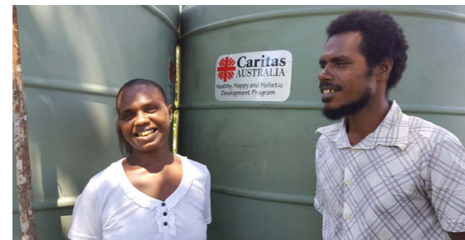
Participants in the Caritas Australia supported Healthy, Happy and Holistic Development program in the Solomon Islands are thriving through your support of life-enhancing programs.

The Beirut explosion has also inspired creative solidarity in response to an urgent crisis and you can read more about how Lebanese-Australians have stepped up in support of their motherland on pages six and seven.