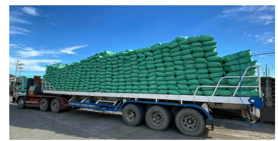
Caritas Australia's partners on the ground are distributing emergency food and medical supplies as typhoon season continues to unfold across South East Asia.

"People are in need of temporary shelters, they also need clean water, food, kitchenware and hygiene kits" says Ate. "They don't have any functional power and communications. The Manide and other vulnerable families are appealing for support and assistance from the good people of Australia."