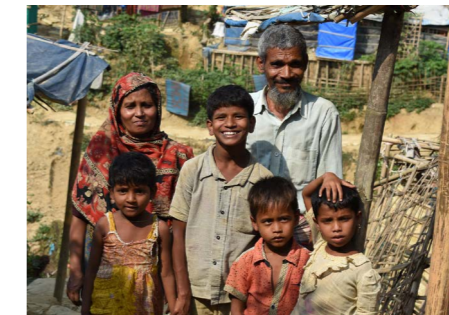
Caritas Australia with its partners on the ground are practicing improved hygiene and safety measures in Rohingya refugee camps.

In Bangladesh, the underlying uncertainty of life in the Rohingya refugee camps has been intensified by the COVID-19 pandemic. Fewer than half of Bangladeshis have access to clean drinking water and one fifth of the population live on less than $5 a day.