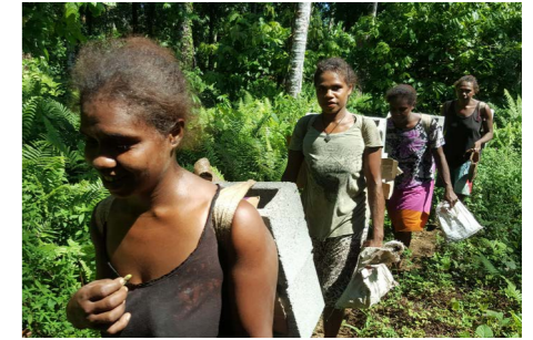
Villagers are building improved infrastructure through your support.

Access to clean water as well as regular hand-washing is equipping villagers to