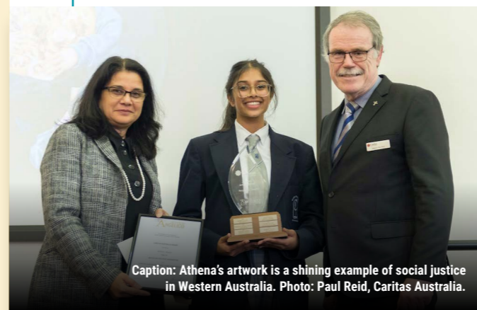
Caption: Athena's artwork is a shining example of social justice in Western Australia.

Thank you Athena for your extraordinary leadership and commitment to social justice!