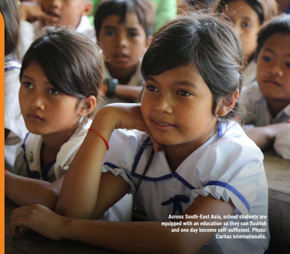
Across South-East Asia, school students are equipped with an education so they can flourish and one day become self-sufficient.

Your messages of love and support are an inspiring example of your commitment to more than three million individuals who Caritas Australia helps annually. Here's what you wanted to tell us about why you give to this work.