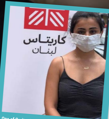
One of Caritas Lebanon's 750 youth volunteers steps up to give her energy and support to blast survivors in Beirut.